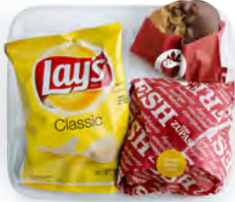
Sandwich Box Sandwich of your choice, potato chips, and a chocolate-dipped cookie $6.99

Keep it simple and ask for a variety assortment of box lunches rather than taking individual orders from your guests. Each box is clearly labeled and there will sure to be something everyone will like.