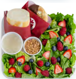
Large Salad Box Choice of salad, fresh bread, and a chocolate-dipped cookie $7.99