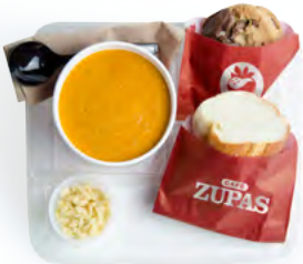
Soup Box Cup of house-made soup, fresh bread, and a chocolate-dipped cookie $5.99