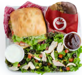
Salad & Sandwich Box Salad and sandwich of your choice and a chocolate-dipped cookie $9.99