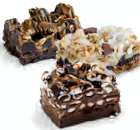
Deluxe Dessert Upgrade Replace the cookie with your choice of a Caramel Rockslide Brownie, Million Dollar Bar, or Rocky Road Brownie $2.99 extra