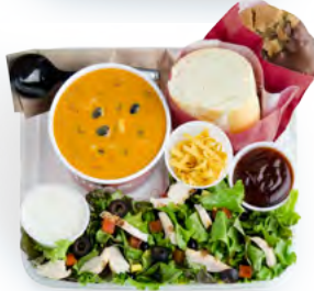
Soup & Salad Box Salad and soup of your choice, fresh bread, and a chocolate-dipped cookie $9.99