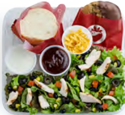
Salad Box Choice of salad, fresh bread, and a chocolate-dipped cookie $6.99