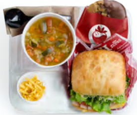
Soup & Sandwich Box Sandwich and soup of your choice (or substitute soup for a fruit cup) and a chocolate-dipped cookie $8.99